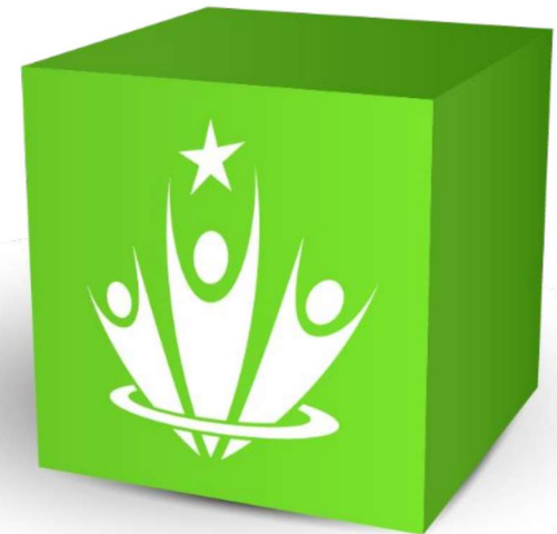
COMMUNITY PRIDE AND CONNECTION